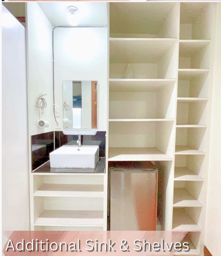
Additional Sink & Shelves